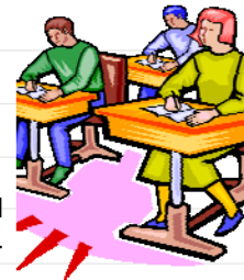
District student enrollment is up again this year!

Happy November! What a fall it has been – so many great things happening in our district, in the classroom and on the court and field. The football team experienced its first play-off game in several years. We had four runners in the state cross country event in Fort Dodge. Our volleyball team is gearing up for state – just one more win to get us there. The marching band (largest band in the history of Treynor with 78 musicians) continued to outdo themselves and made us all proud of their accomplishments. I must confess, I do miss seeing the cross country team running those early morning hours. I wish that I had that energy and commitment!