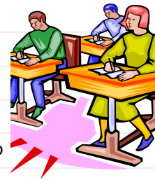
District student enrollment is up again this year!

Happy November! What a fall it has been – so many great things happening in our district, in the classroom and on the court and field. While Homecoming was wet, it did not dampen our spirits and proved to be very successful with the huge community turnout for the pep rally, a new king and queen, a victory for the team, and a dance that had everyone in their best “duds” dancing the night away. The marching band continued to outdo themselves and made us all proud of their accomplishments. And volleyball is still going! I must confess, I do miss seeing the cross country team running those early morning hours. I wish that I had that energy and commitment!